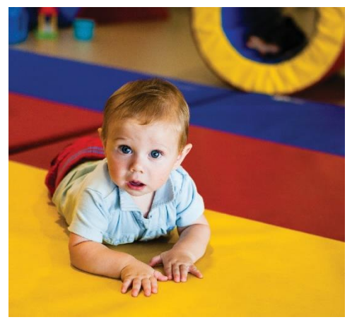
Discover To find something unexpectedly.