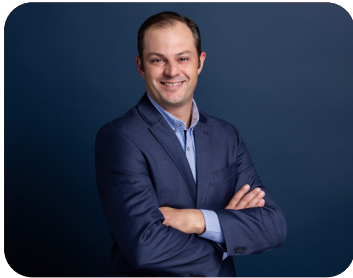
Antoine Vezina Chair