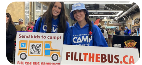
Across the YMCA of Northeastern Ontario as of September 2025